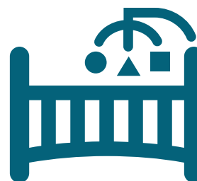
New crib and mattress