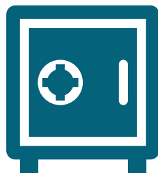
Medication lock box