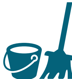
Vacuum cleaner/cleaning supplies